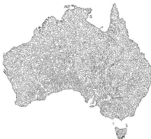
Figure 1. Catchment delineations for Australia.

The land surface model used in this study is the catchment-based land surface model (CLSM) of Koster et al. (2000). The key innovations of this model are the explicit inclusion of sub-catchment spatial variability and the model domain, which is